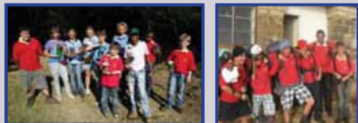
3rd Newcastle scouts enjoy the magnificent scenery on their Mullers Pass hike.

On the 19th May 2012, six Scouts of the 3rd Newcastle Scout Troop hiked from Normandien pass to Mullers Pass on an overnight hike. A couple of BIG baboons were sighted along the way to the picturesque Ncandu Falls where they stopped for lunch. Ncandu Forest Reserve Hut was a welcome sight for the overnight stop, food was prepared and the scouts settled down for the cool night ahead. The scouts woke to a beautiful sunrise atop the mountain with a carpet of mist covering the valley below. A quick breakfast before hitting the trail to Moorfield, Mullers Pass to get their transport home. An awesome experience for all who attended.